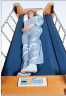
A Lateral Rotation