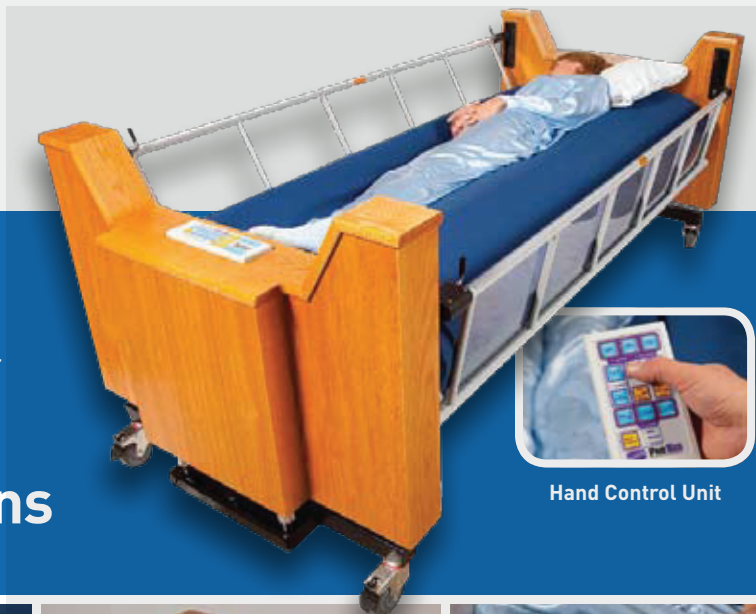
Hand Control Unit

Smooth, safe, quiet operation for only $.04 per day. Provides restful sleep for users and care-givers.