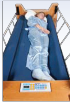
B Head and Leg Elevation