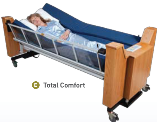
E Total Comfort